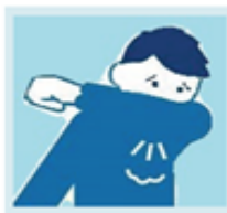
Cover your mouth and nose when