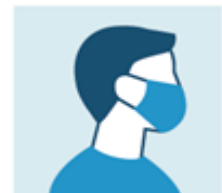
Wear a mask only if sick