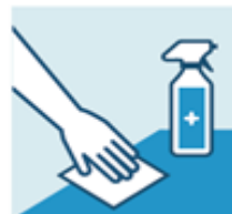
Keep objects and surfaces clean