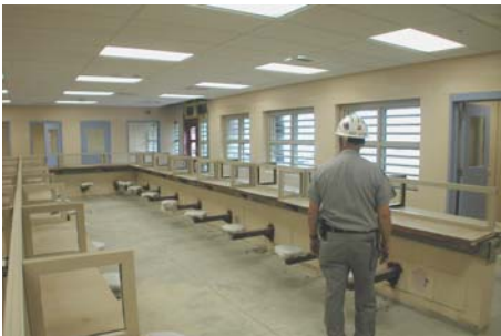
Sgt. Cook in Contact Visitation