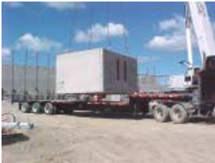
First Cell Arrives on Truck