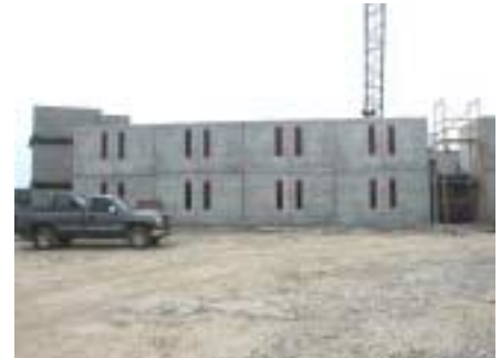
Two story cells installed in HB