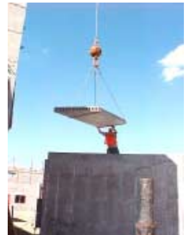
First mezzanine plank in HB