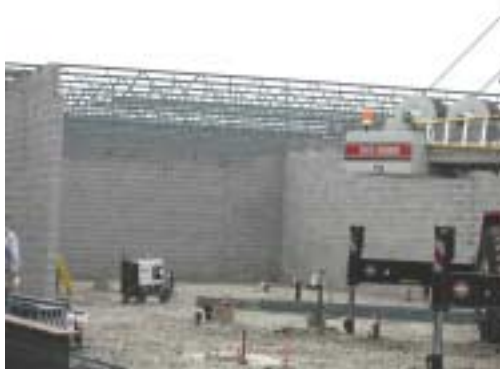
First steel roof joists set in SB2