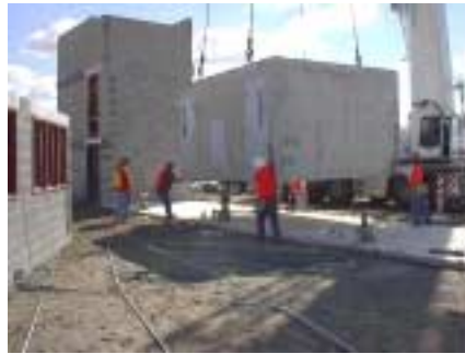
Setting first cell in HB