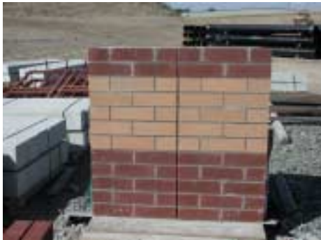
Masonry wall sample