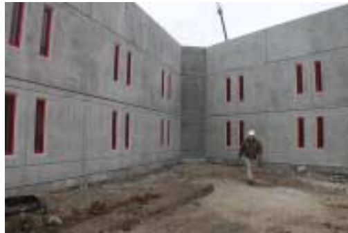
Exterior finish on cells, HB & HC junction