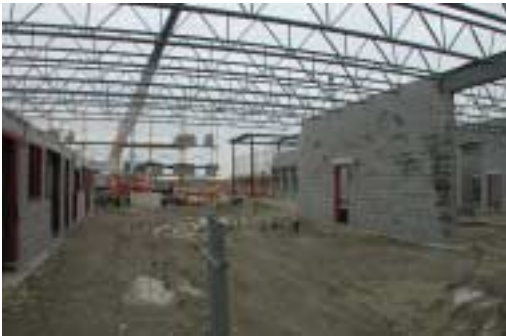
Roof Joists over infirmary