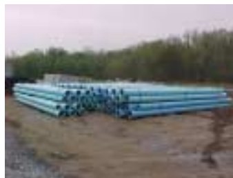
Water Pipe on site