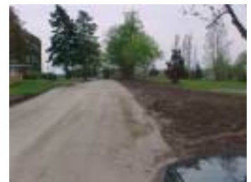
Duct bank installation