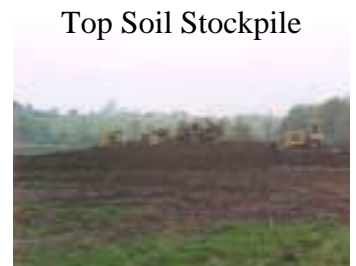
Top Soil Stockpile