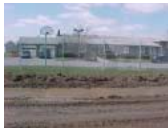
Youth Care Fence