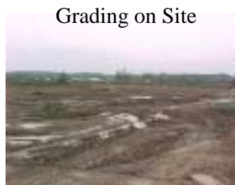
Grading on Site