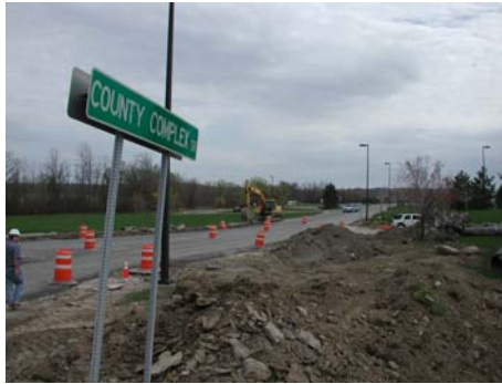
Entry Road Work begins