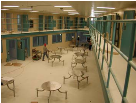
Dayroom furniture in HB (Pod 2)