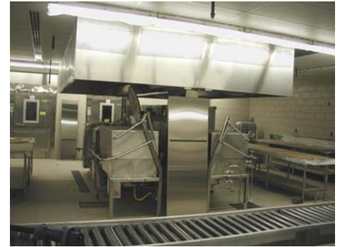
Kitchen Equipment installed

Respectfully Submitted by Thomas P. Harvey AICP