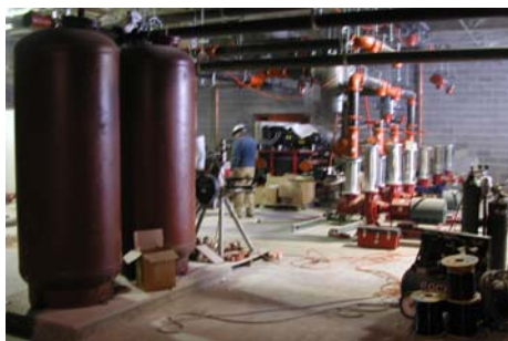
HVAC Circulator pumps, SB2