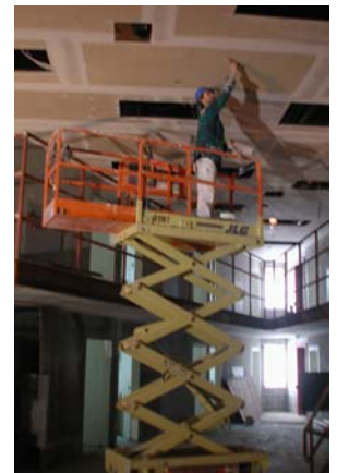
Ceiling work in HE: