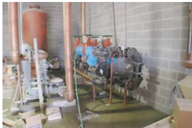
Permanent Water Service