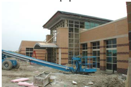
Front lobby looking north