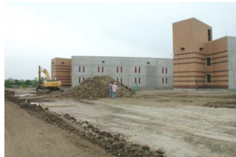
Grading on east side of building

Respectfully Submitted by Thomas P. Harvey AICP