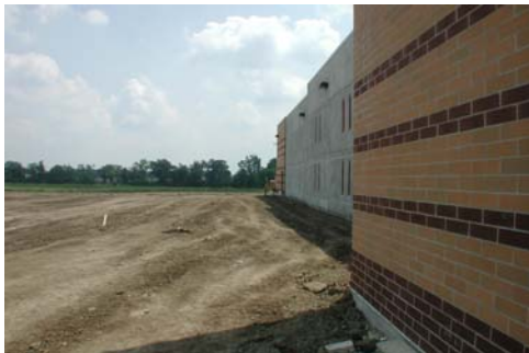
Final Grading on north side of building