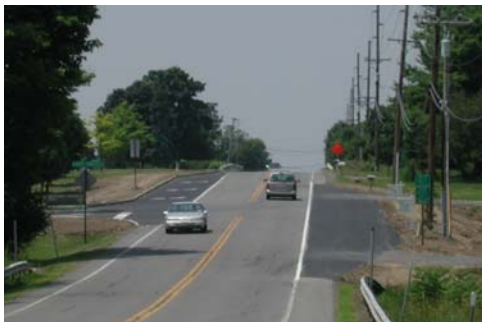
← County Road 46 lane widening

Respectfully Submitted by Thomas P. Harvey AICP