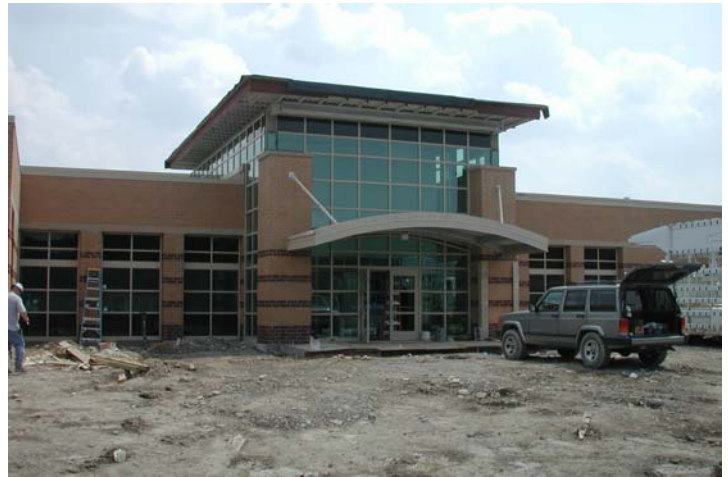
New Jail Lobby