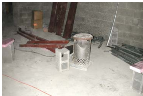
Temporary heater (small propane)