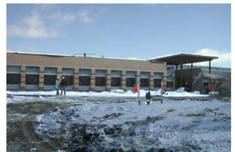
Exterior brick SB6