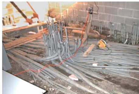
Security system conduit before -----and after slab pour