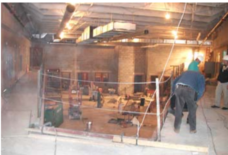
HB Mezzanine, temporary railing