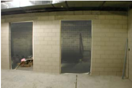
Kitchen, walk in cooler preparation