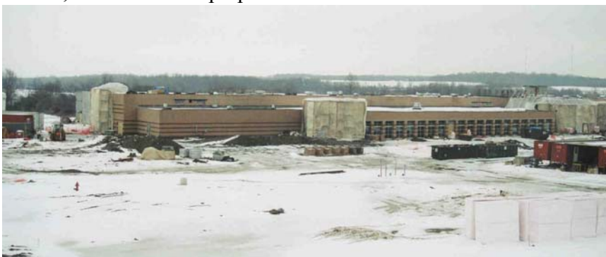
Building exterior

Respectfully Submitted by Thomas P. Harvey AICP