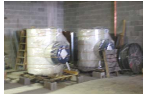
Domestic Hot Water Heaters