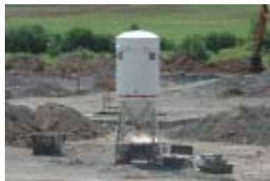
Concrete mixing tower on site