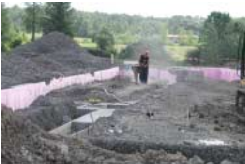
Interior Cell Footers-HB