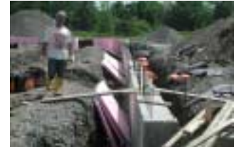
Foundation insulation HB