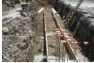
SB2 Footers at Medical