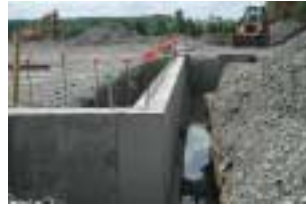
Foundation Wall SB2