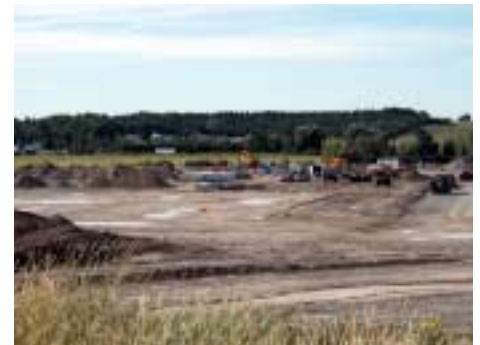
Completion of all Building Pads