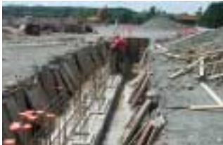
Footers at SB2