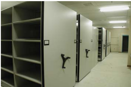
Inmate Property Storage System