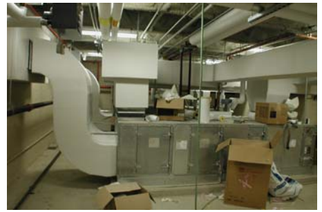
HG Mechanical Room