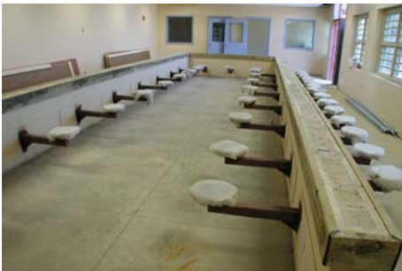
Contact Visitation Room