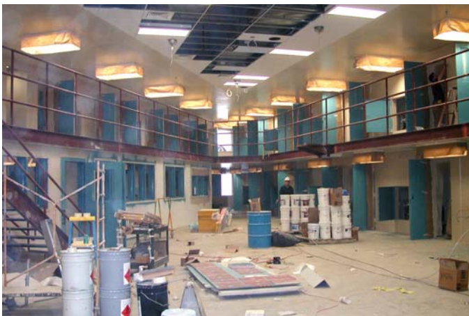
Painting in Pod HB (Pod 2)