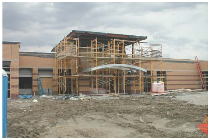
Lobby Entry Canopy