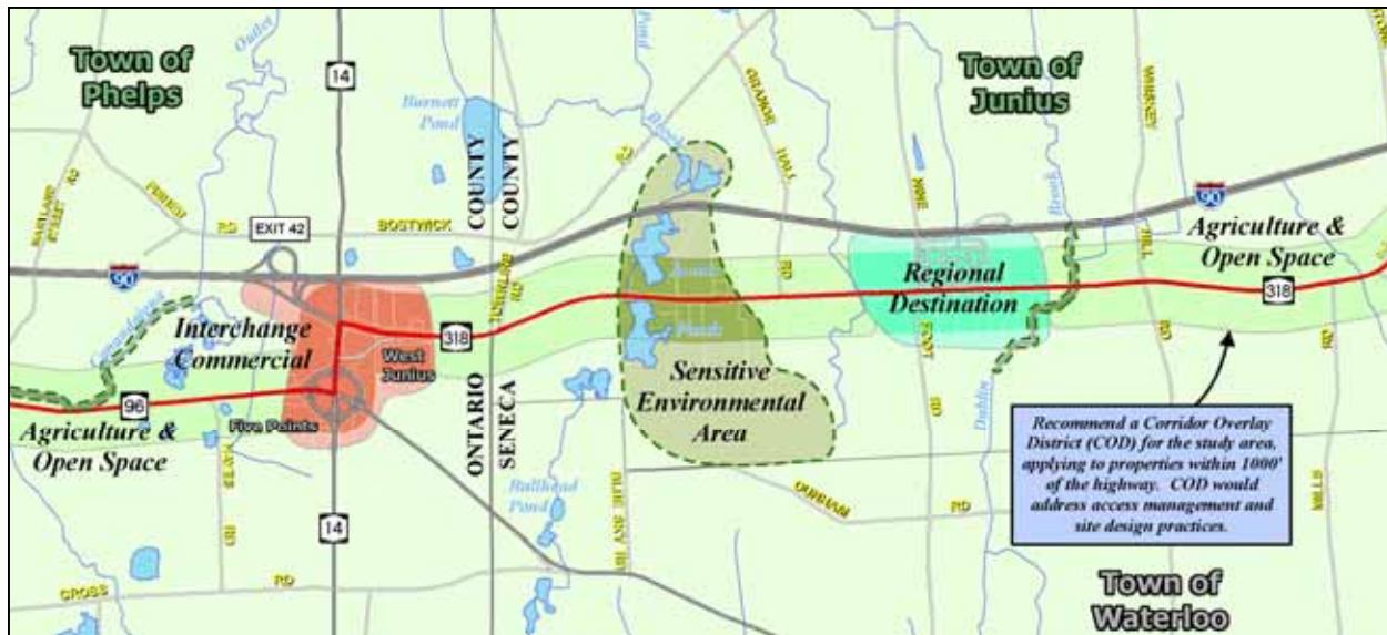
Excerpt from Map 9: Corridor-Wide Future Land Use Plan